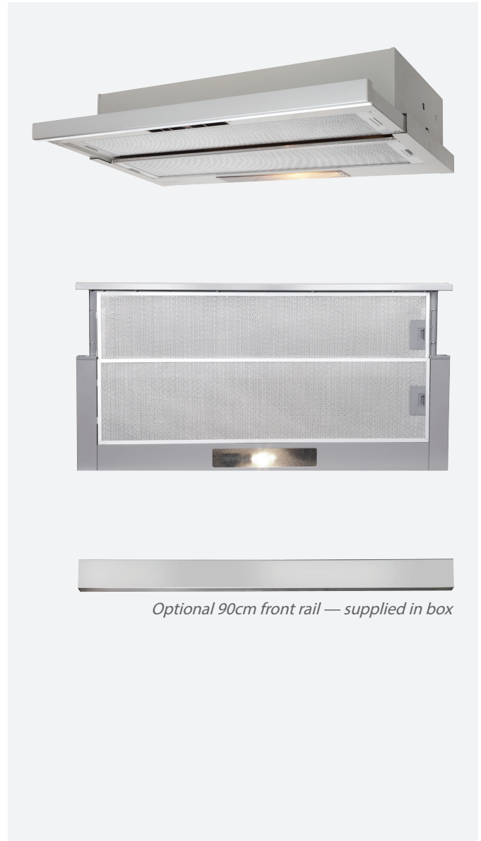
Optional 90cm front rail — supplied in box