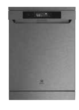
ESF6767KXA Freeslanding dishwasher