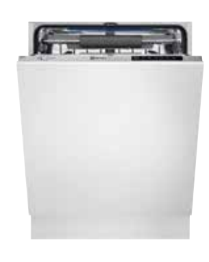
ESL8530RO Fully-integrated dishwasher