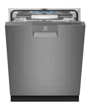
ESF8735RKX Built-under dishwasher with ComfortLift®