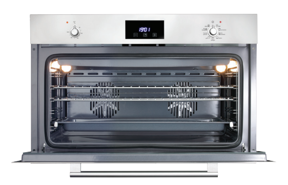
ULTRA-Clean smooth grey cavity with Twin Fan Oven Cavity

The new size of the cooking cavity provides more cooking space and maximises the full internal size of the oven. Our new ULTRA-Clean light grey, nickel-free enamel interior reduces the toxicity of materials in contact with foods and is easy to clean. Another new feature is the S-MOVE soft-closing door allows you to gently close the oven door with a simple push, preventing door impact; without using your hands, which are free to perform other tasks. Standard in the oven are Telescopic racks and are totally removable making the use of the ovens baking trays and general cooking in the oven easy and effortless. The Full size inner door glass provides a panoramic view from the outside of the oven door of what is inside the oven, its fill width also enables easy cleaning with no crevices for food scraps and residue to get trapped.