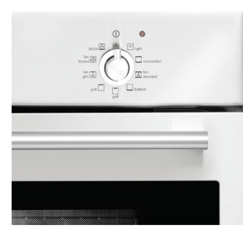
Laser etched cooking modes on control panel with symbol & words