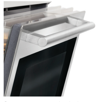
S-move soft & gentle closing door hinges