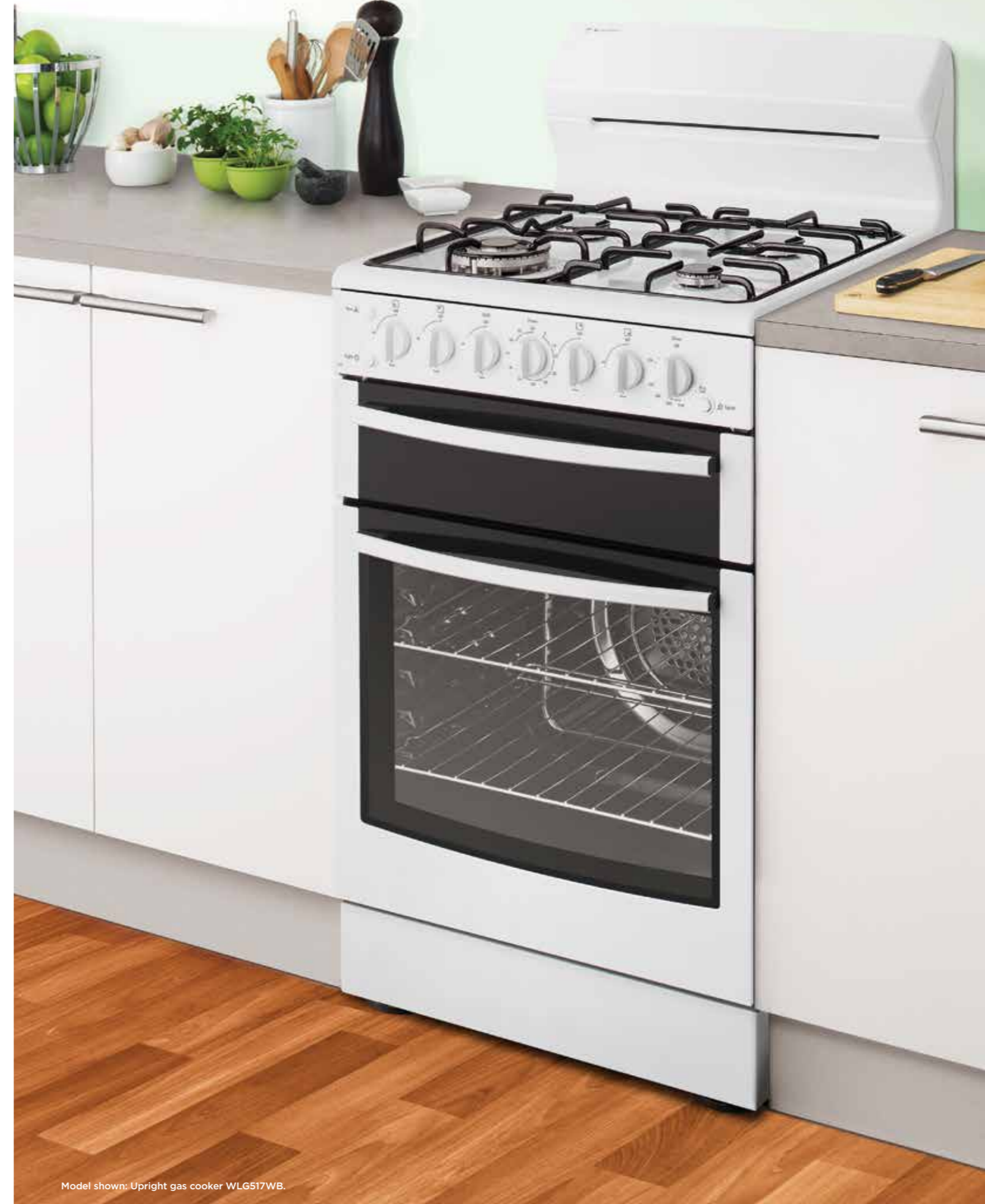
Model shown: Upright gas cooker WLG517WB.

Dimensions refer to overall dimensions of the product, not actual cut-out sizes. Depth excludes knobs and handles.