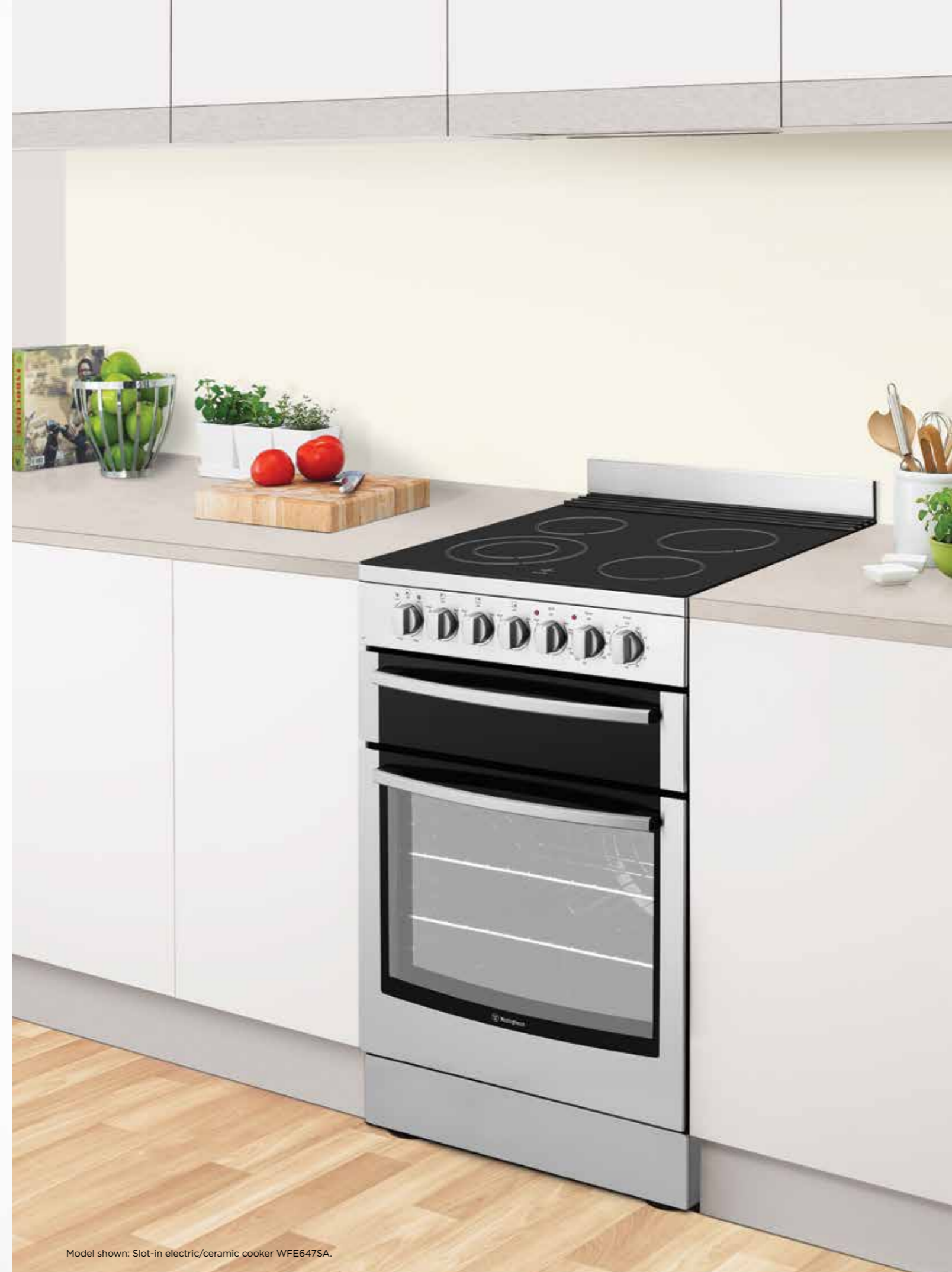
Model shown: Slot-in electric/ceramic cooker WFE647SA.

Created with safety in mind, the flame failure safety device will immediately shut off the gas supply if the flame on the cooktop is unexpectedly extinguished.