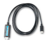
VE.Direct to USB interface