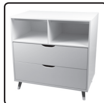
Zuri Drawer Chest #095610

For more information regarding our full range of coordinating furniture, please visit the CNP Brands website at www.cnpbrands.com.au and click the bebe care brand link, or contact our Sales Department on 1300 667 137 to make your enquiry.