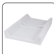
Universal Change Pad # 115153-003