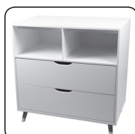
Zuri Drawer Chest # 095610