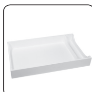
Zuri Change Top # 095611