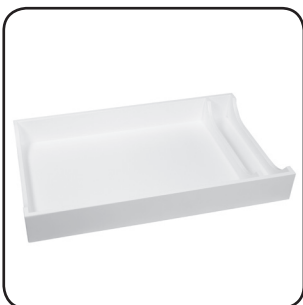
Zuri Change Top #095611 (Pre-assembled)